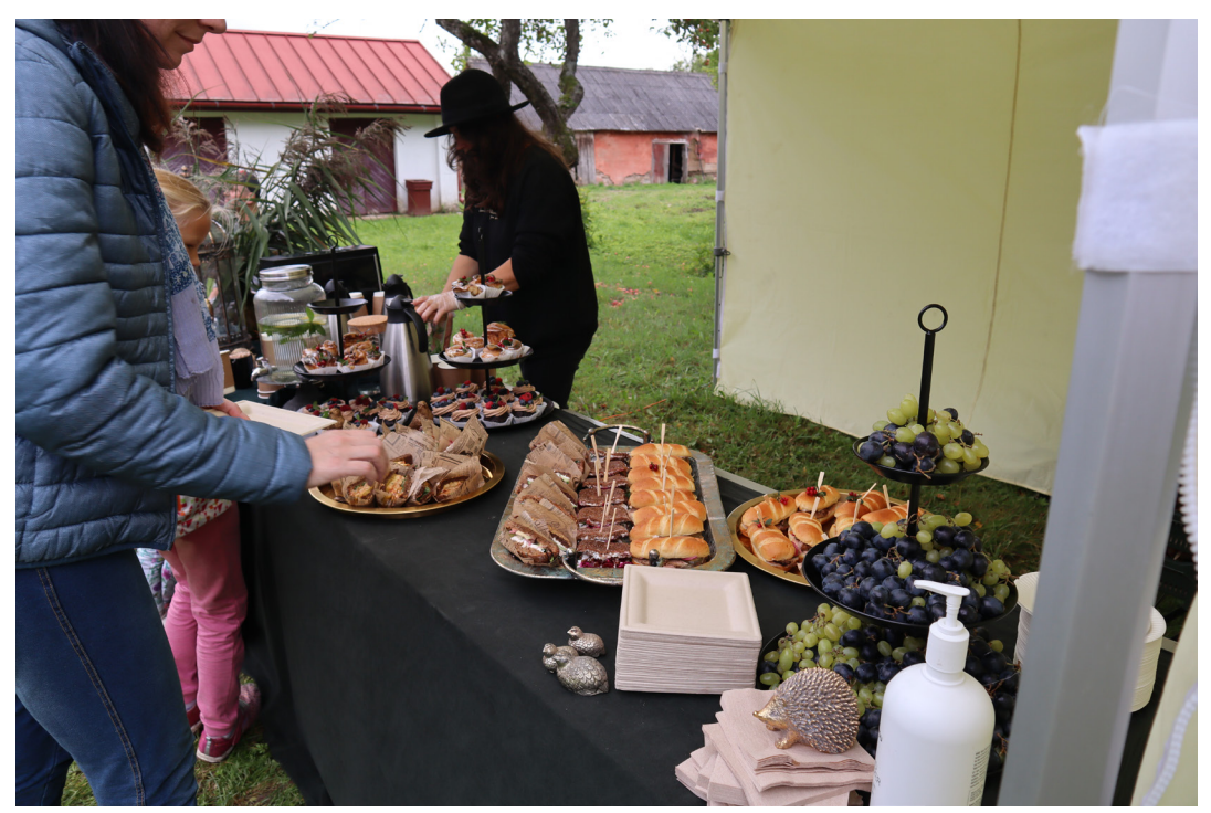
The event had to be Covid-modified but the guests – keeping a safe distance – still had a nice picnic outdoors.

side of the birdwatching tourism, to see the new Šlītere Lighthouse exhibition "Bird migration routes" (also held within the framework of the project "Baltic Wings"), as well as to have a walk through the Slītere Blue mountain area of the Slītere National park in the company of the nature experts. Each participant of the event received a copy of the book.